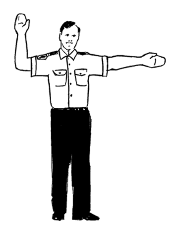
figure 1(e) combination from front and rear