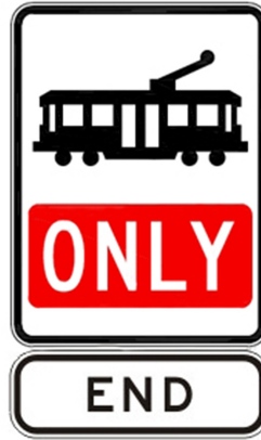
End tramway sign