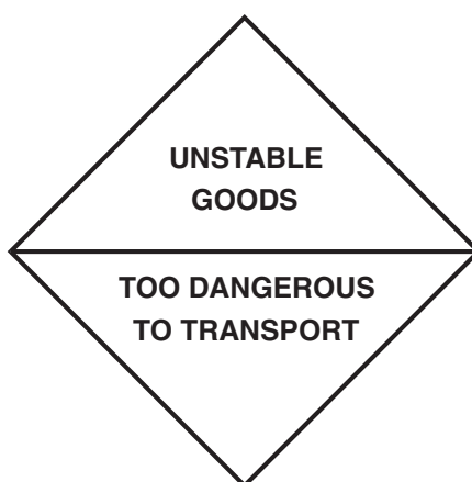
Figure 4—Form of a label for goods too dangerous to be transported