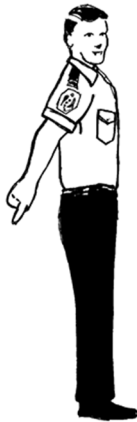
figure 3(b) behind