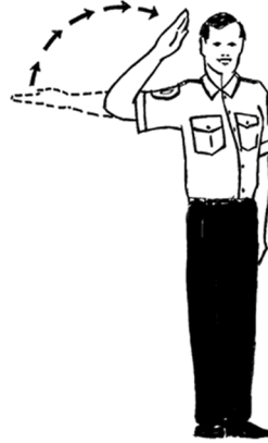
figure 2(c) from right side