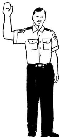
figure 1(a) from the front