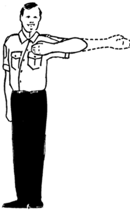
figure 2(a) from left side