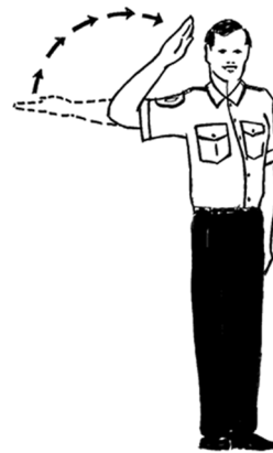
figure 2(c) from right side