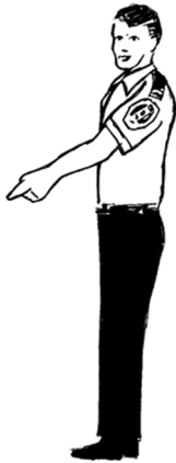
figure 3(a) in front