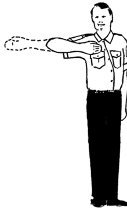
figure 2(b) from right side