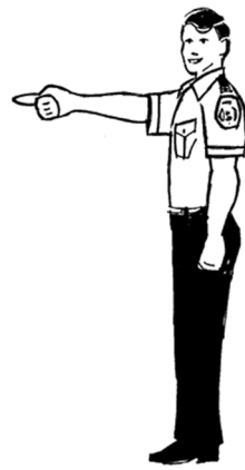
figure 3(c) at kerb etc.