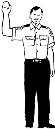
figure 1(a) from the front