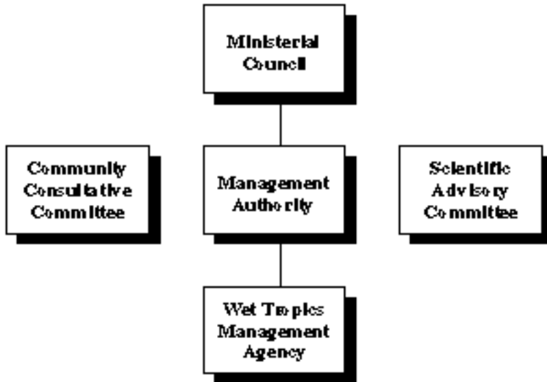
Figure A. Wet Tropics of Queensland Management Schema