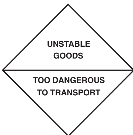
Figure 4—Form of a label for goods too dangerous to be transported