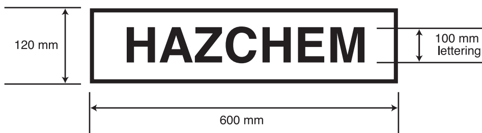
Figure 1—Form and dimensions of a HAZCHEM outer warning placard