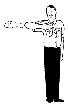
figure 2(b) from right side