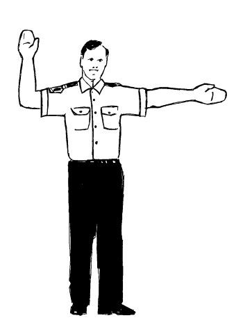
figure 1(e) combination from front and rear