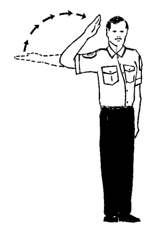
figure 2(c) from right side